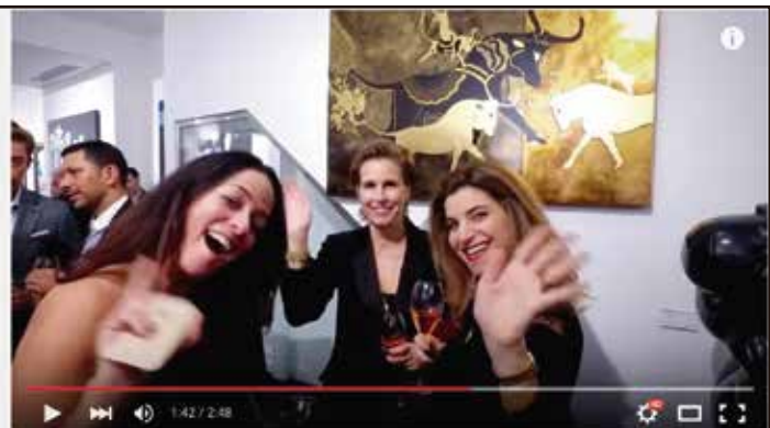
Opening night at the Maddox Gallery, Mayfair