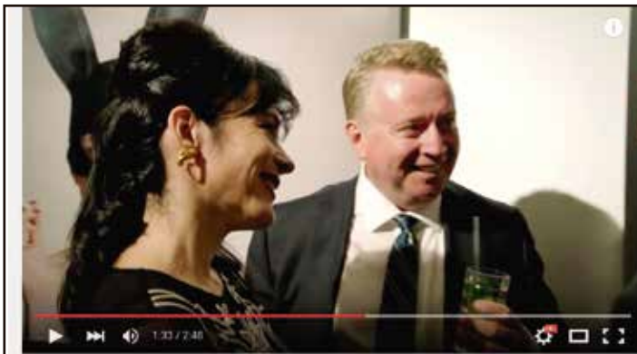
Opening night at the Maddox Gallery, Mayfair